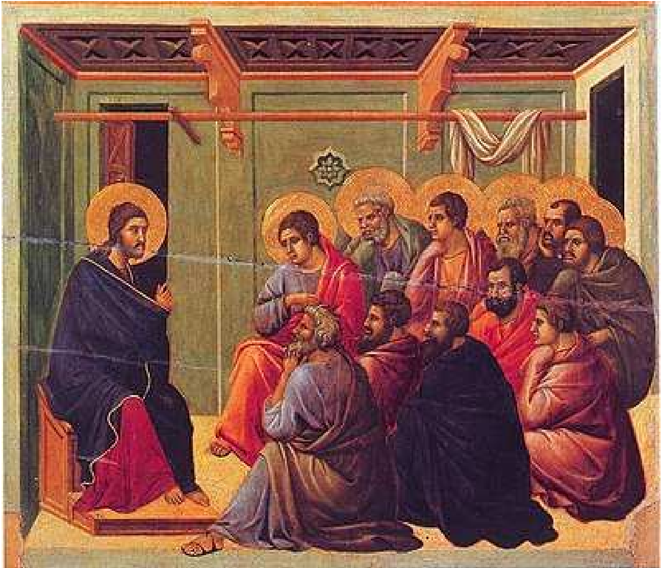
Jesus giving the Farewell Discourse (John 14–17) to his disciples, after the Last Supper, from the Maestà by Duccio , 1308–1311