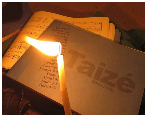
Songbook with lighted candle at Taizé Saturday evening prayer, photo by Christian Pulfrich, public domain, https://commons.wikimedia.org/wiki/File:Liederheft_beim_Lichtergottesdienst.jpg

www.SundaysandSeasons.com , © 2024, Augsburg Fortress.