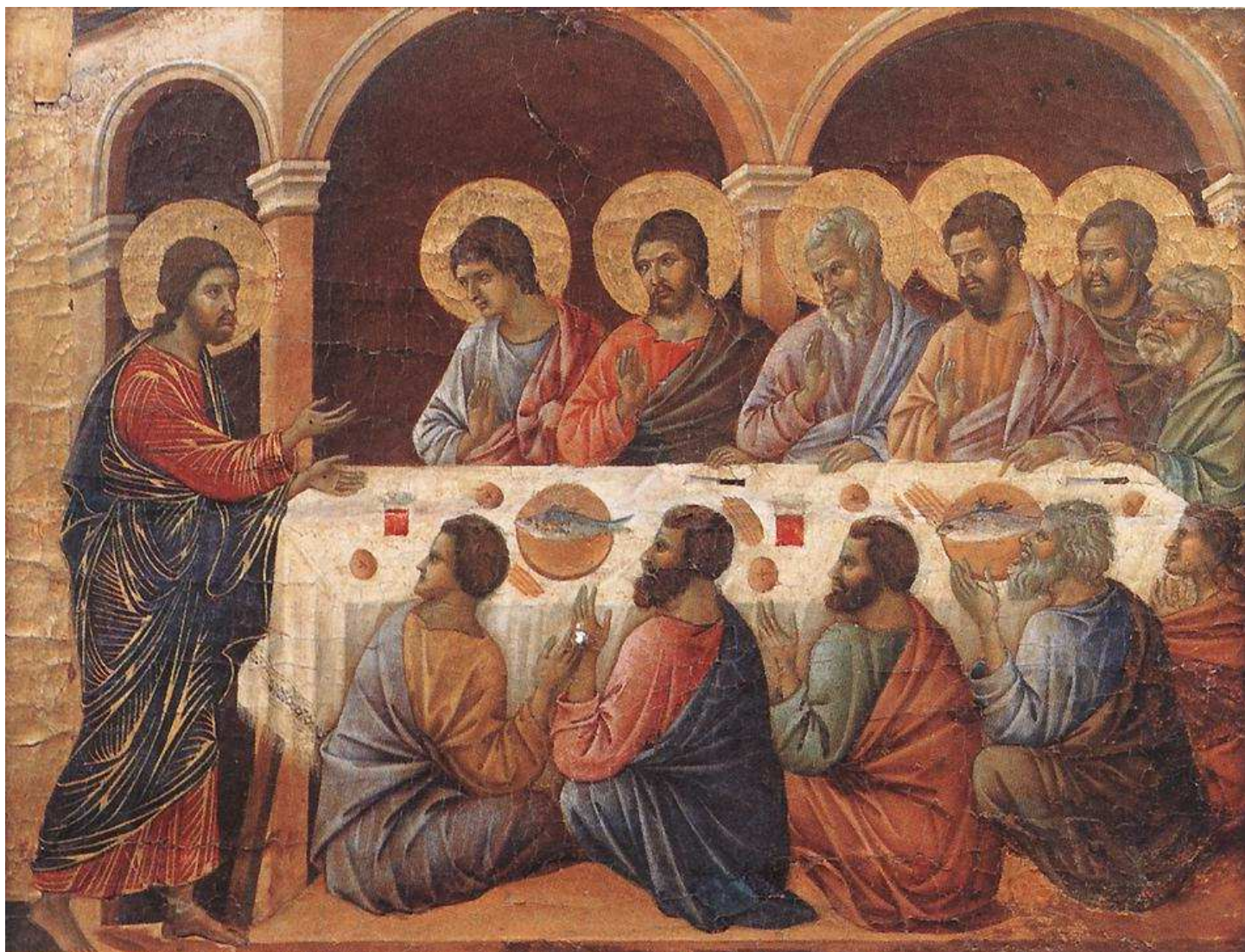
Duccio di Buoninsegna, "Appearance While the Apostles Are at Table," (1308-11), Tempera on wood