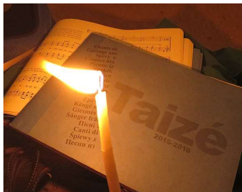
Songbook with lighted candle at Taizé Saturday evening prayer, photo by Christian Pulfrich, public domain, https://commons.wikimedia.org/wiki/File:Liederheft_beim_Lichtergottesdienst.jpg

www.SundaysandSeasons.com , © 2024, Augsburg Fortress.