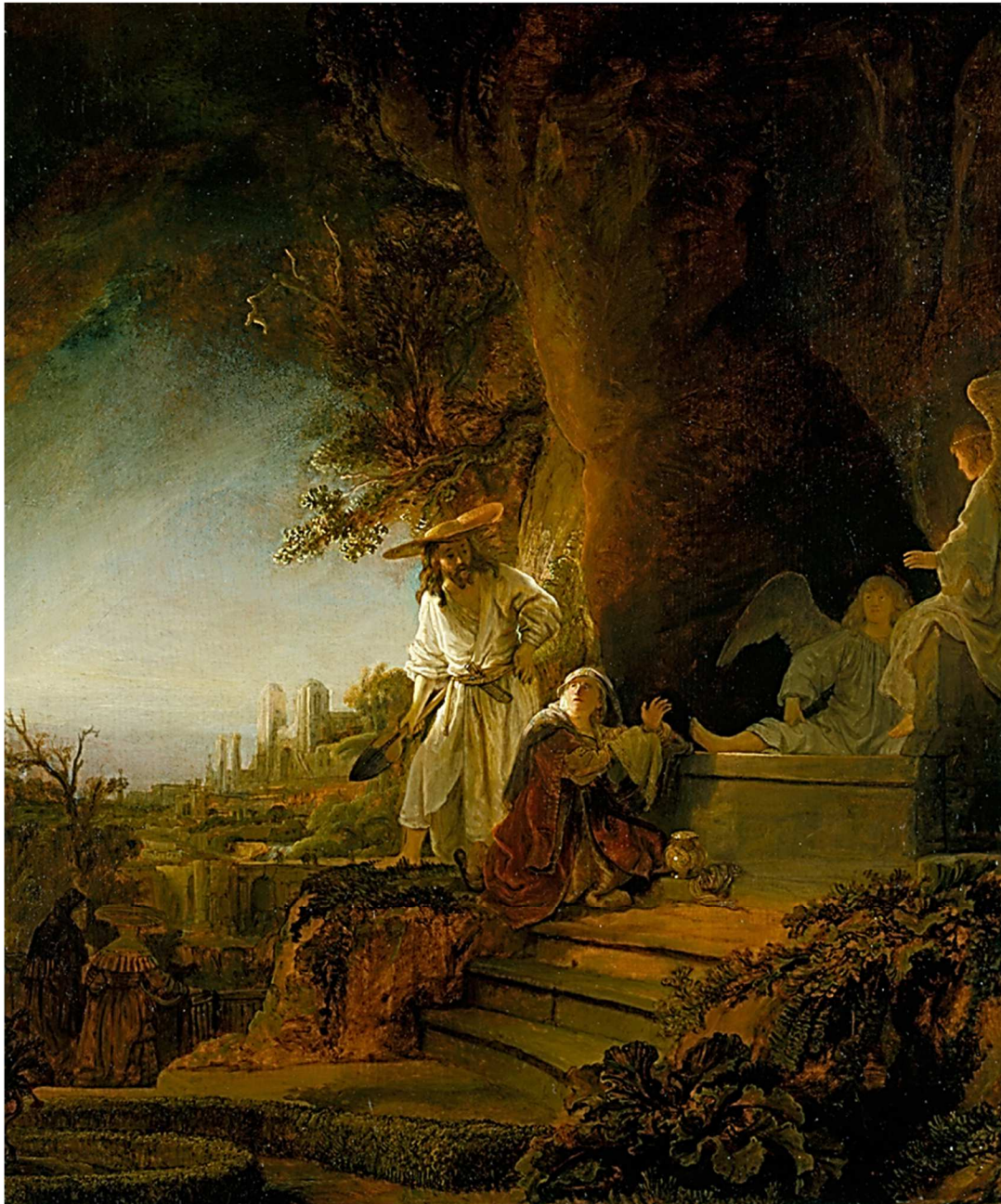
Rembrandt Harmenszoon van Rijn, 1606-1669. Christ and St. Mary Magdalene at the Tomb