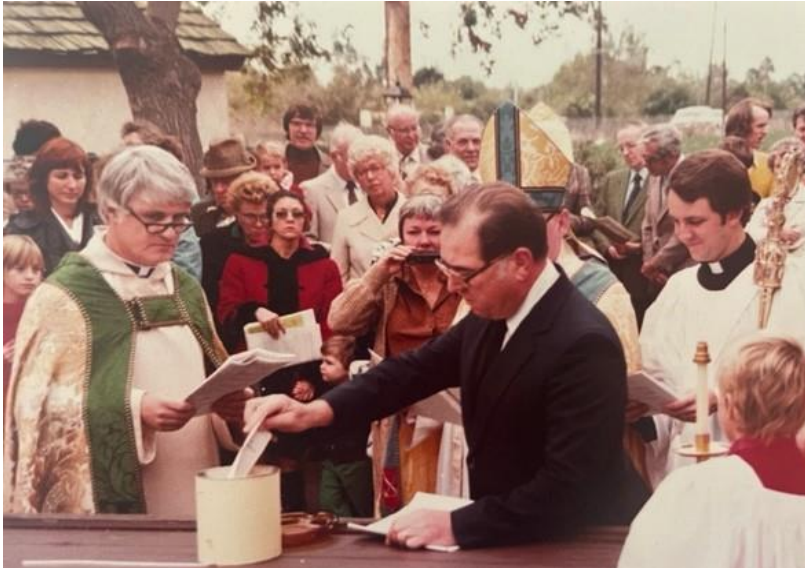
Burning the Mortgage 1980

In the end, we hope this profile accurately portrays St. Columba's of Camarillo, but more than narratives, data, and statistics, we are people. Here are some of the people of St. Columba's over our almost 75 years: