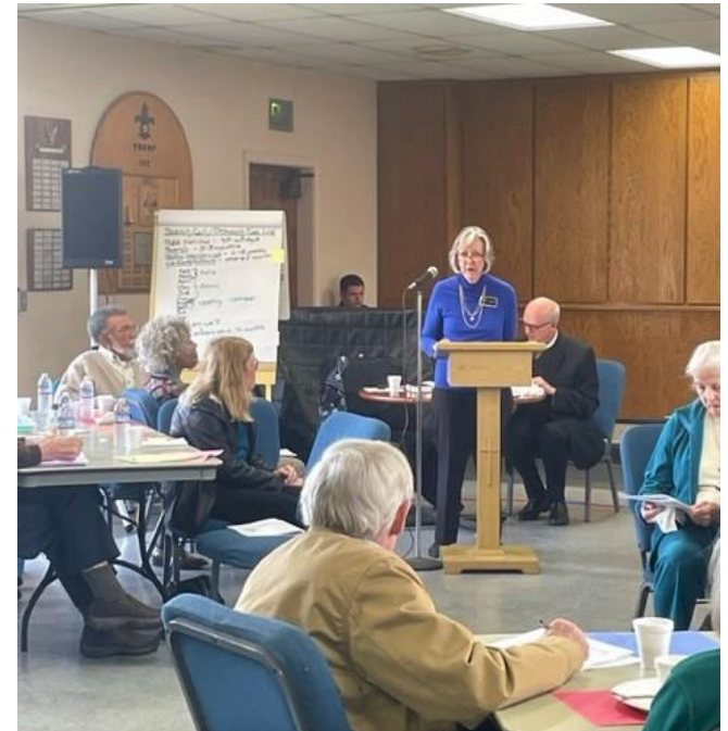
Annual Meeting 2023