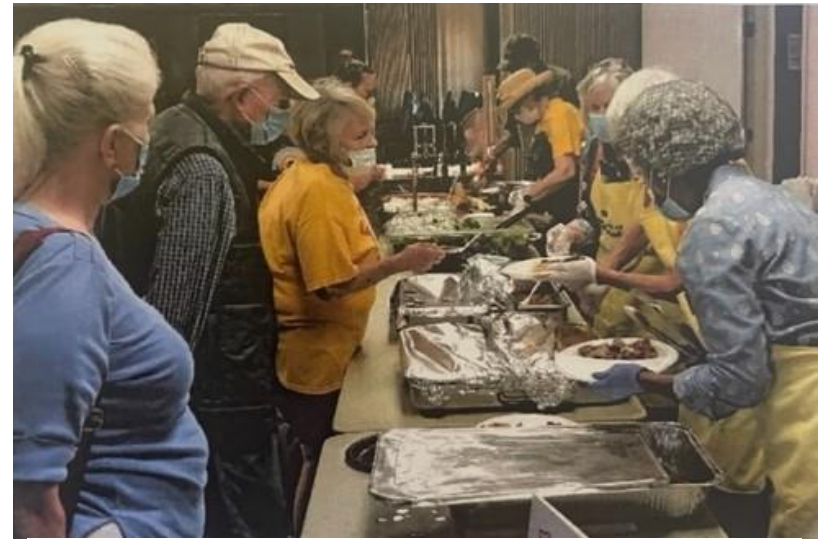
1st Post-Pandemic Parish Barbeque - 2022