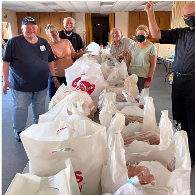
Food Ministry 2023