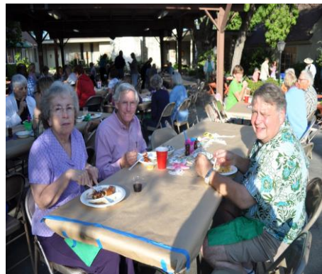
Parish Clambake 2011