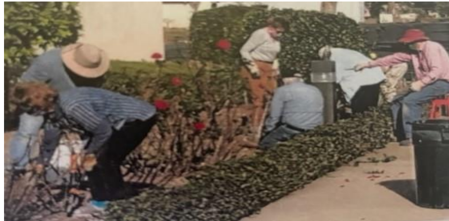
Pruning the Roses Outside the Church