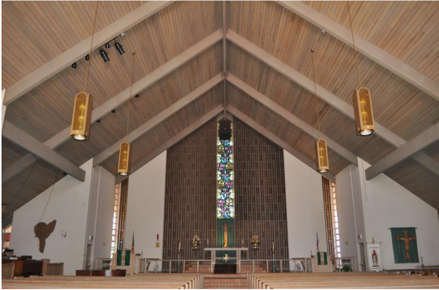
St. Columba's Sanctuary – Built in 1967