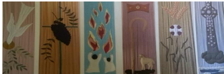
Handsewn Banners Decorate the Sanctuary