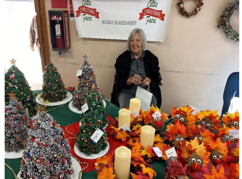
Celtic Faire 2023